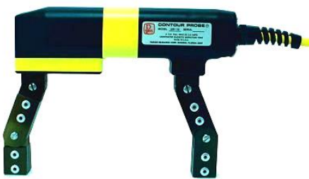
Figure 1: UW-12 / UW-115

DESCRIPTION: The Parker underwater Contour Probes are electromagnets capable of inducing a strong magnetic field in ferromagnetic materials for the purpose of performing Magnetic Particle Inspections. The UW-115 produces an A.C. magnetic field from a GFI protected 115 VAC power source. The UW-12 produces a D.C. magnetic field from a 12V battery or 12 VDC power supply.