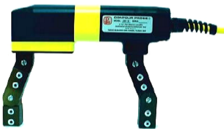
Figure 1: UW-12 / UW-115

DESCRIPTION: The Parker underwater Contour Probes are electromagnets capable of inducing a strong magnetic field in ferromagnetic materials for the purpose of performing Magnetic Particle Inspections. The UW-115 produces an A.C. magnetic field from a GFI protected 115VAC power source. The UW-12 produces a D.C. magnetic field from a 12V battery or 12VDC power supply.