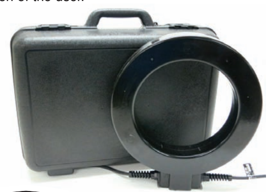
PL-10 with Case

For the correct and safe use of this equipment, proper training of operating personnel to required inspection techniques, specifications and safety requirements is necessary, and is the obligation of the user.